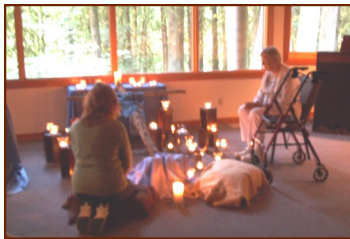
Prayer around the Cross