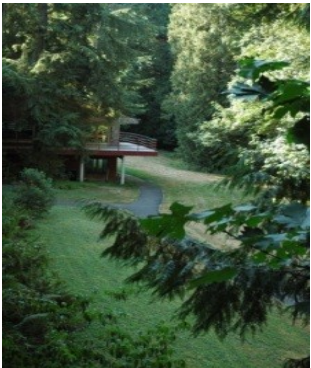
The forested setting at Alton L. Collins Retreat Center

Above all, you will have time to take in the beauty of the forest, listen to Christ within your heart and be renewed.